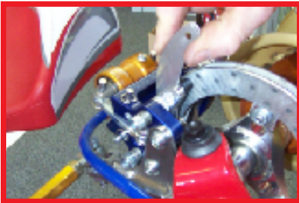
Slide shim between the caliper and pad backing plate