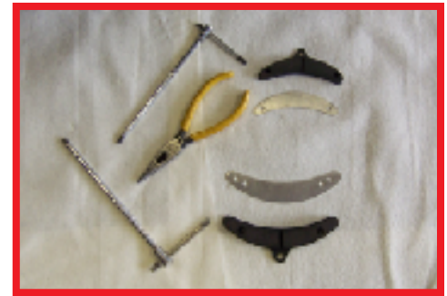
Adding Brake Shims - Step 1