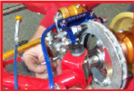
Replace worn out pads by removing brake pad bolts