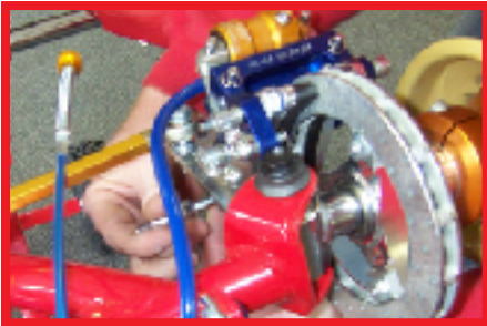
Remove brake pad bolts