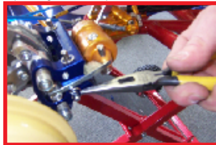
Remove brake pin circlip and remove brake pin