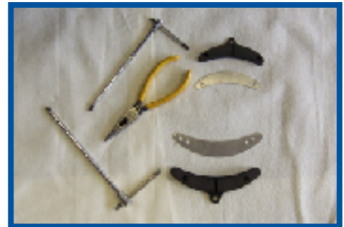
Adding Brake Shims - Step 1