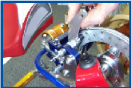
Slide shim between the caliper and pad backing plate