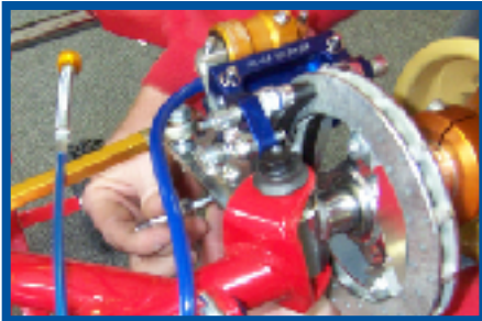
Remove brake pad bolts