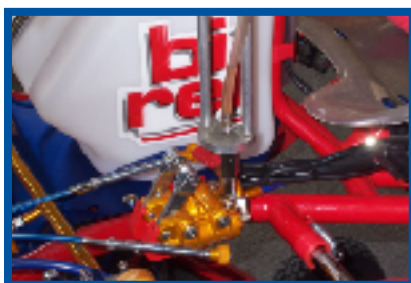
Install brake bleeder

Remove master cylinder screw & inspect O-ring for damage or wear (new o-rings available in master cylinder rebuild kit). Screw in brake bleeder, making sure the correct fitting is used.